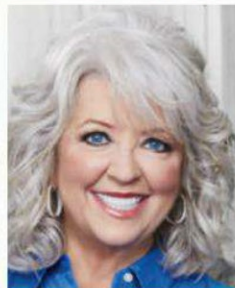
Paula's LEMON BARS