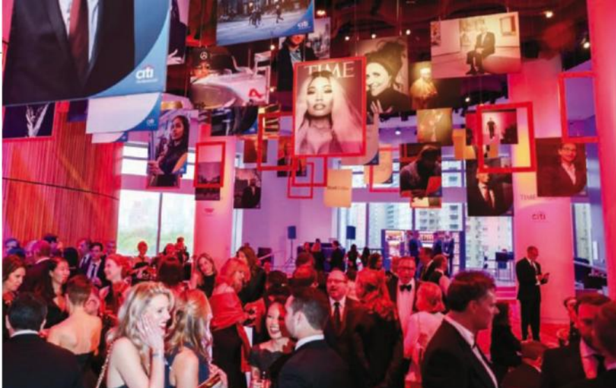
THE PREGAME TIME 100 guests mingle before dinner at the Time Warner Center