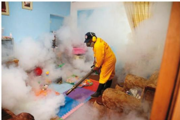
A fumigator battles Zika in Peru