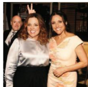
ACTING UP Comedians Melissa McCarthy, center left, and Julia Louis-Dreyfus get photo-bombed by astronaut Scott Kelly