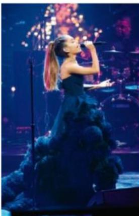
ONSTAGE Ariana Grande sang "Dangerous Woman" and "Leave Me Lonely"