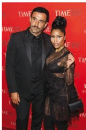
ARTISTRY Designer Riccardo Tisci, left, with rapper Nicki Minaj