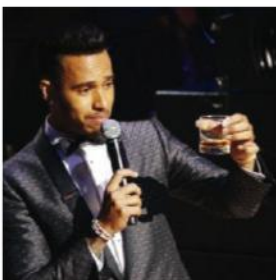
TRIBUTE Formula One champion Lewis Hamilton toasts the memory of Prince, "arguably the best artist of all time"