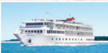
THE NEWEST SHIPS

Call toll-free 1-800-981-9139 www.AmericanCruiseLines.com